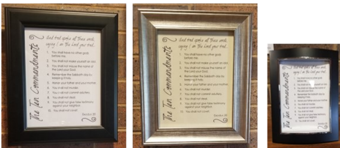
Contemporary Style in various frames