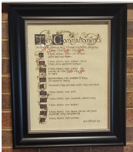
Traditional Style in 11 x 14 Traditional Black Frame

This Thank-you Gift is for our FAITHFUL SUMC MEMBERS and is given at NO COST TO YOU (Privately funded)